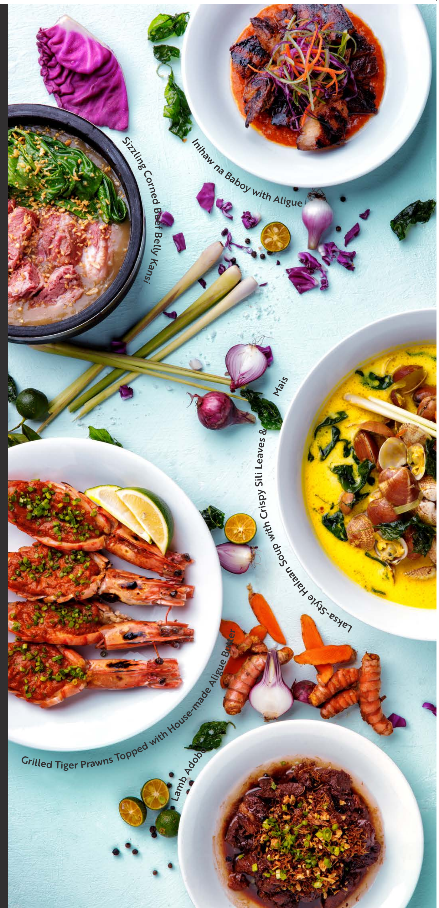
Sizzling Corned Beef Belly Kansil

All our prices are inclusive of VAT. Only a service charge of 10% will apply.