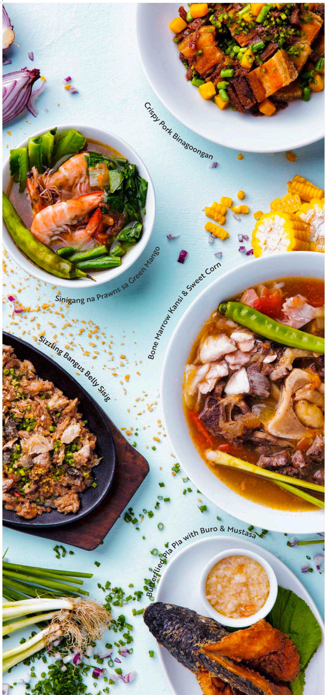
Crispy Pork Binagoongan